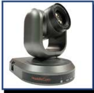
Huddle Cam (Huddle Camera - for Zoom)