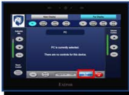
Touch Panel Example #1