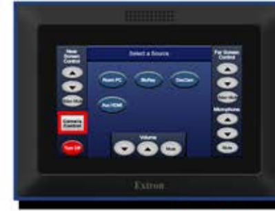
Touch Panel Example #2